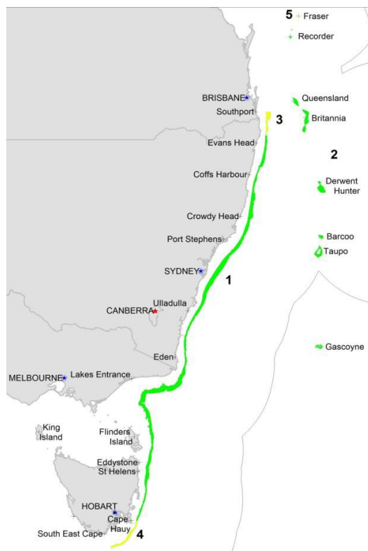
Figure 1: The distribution of Harrison’s dogfish. (1) core continental margin habitat; (2) core seamount habitat; (3 & 4) northern and southern extra-limital distribution on margin; (5) Fraser seamount extra- limital distribution on seamounts. Source: Source: Williams et al. , 2012a, Part 1.

Southern dogfish is endemic to southern Australia from Shark Bay in Western Australia to Forster in NSW. The species’ core distribution extends from Port Stephens in NSW to Flinders Island off Tasmania, and from western Bass Strait to south of Ceduna in the eastern Great Australian Bight (GAB), with a gap in distribution over the Ceduna Terrace. However, the distributional status of southern dogfish from the western GAB to Bunbury remains uncertain, largely due to a lack of reliable species-specific identification in commercial catch data in that region (Williams et al. , 2012a, Part 2). Core and extra-limital areas of the species’ ranges are identified in Figure 2.