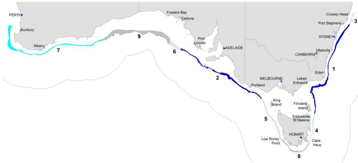
Figure 2: The distribution of southern dogfish. (1) core eastern habitat; (2) core eastern GAB habitat; (3) northeastern extra-limital distribution; (4 & 5) eastern and western Tasmanian extra-limital distribution; (6) eastern GAB extra-limital distribution; (7) southwestern area with insufficient data to determine distributional status; (8 & 9) apparent gaps in distribution off southern Tasmania and Head of Bight.

Endeavour dogfish is more widespread than Harrison’s dogfish and southern dogfish, occurring in the western Indian Ocean off South Africa and western Pacific around the Philippines, Indonesia, Taiwan, Japan and Australia. Within Australia, endeavour dogfish occurs along the west and east coasts but is uncommon off the south coast of Australia.