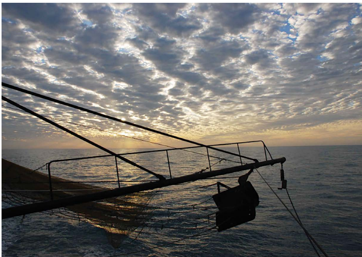
Boom Trawl

Amendments to the Torres Strait Fisheries Act and Regulations are required prior to implementing the use of Infringement notices in the Torres Strait Protected Zone.