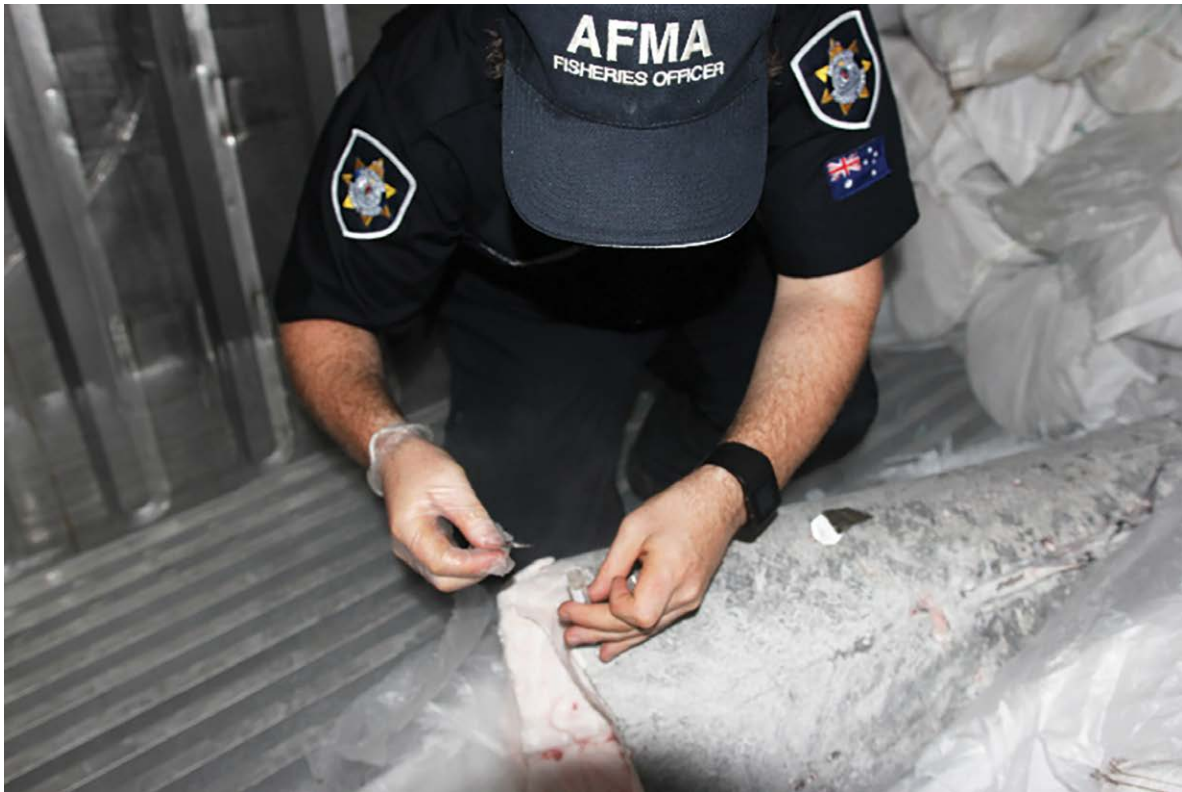
AFMA fisheries officer conducting DNA Sampling