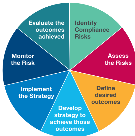
FIGURE 2: Compliance Risk Cycle