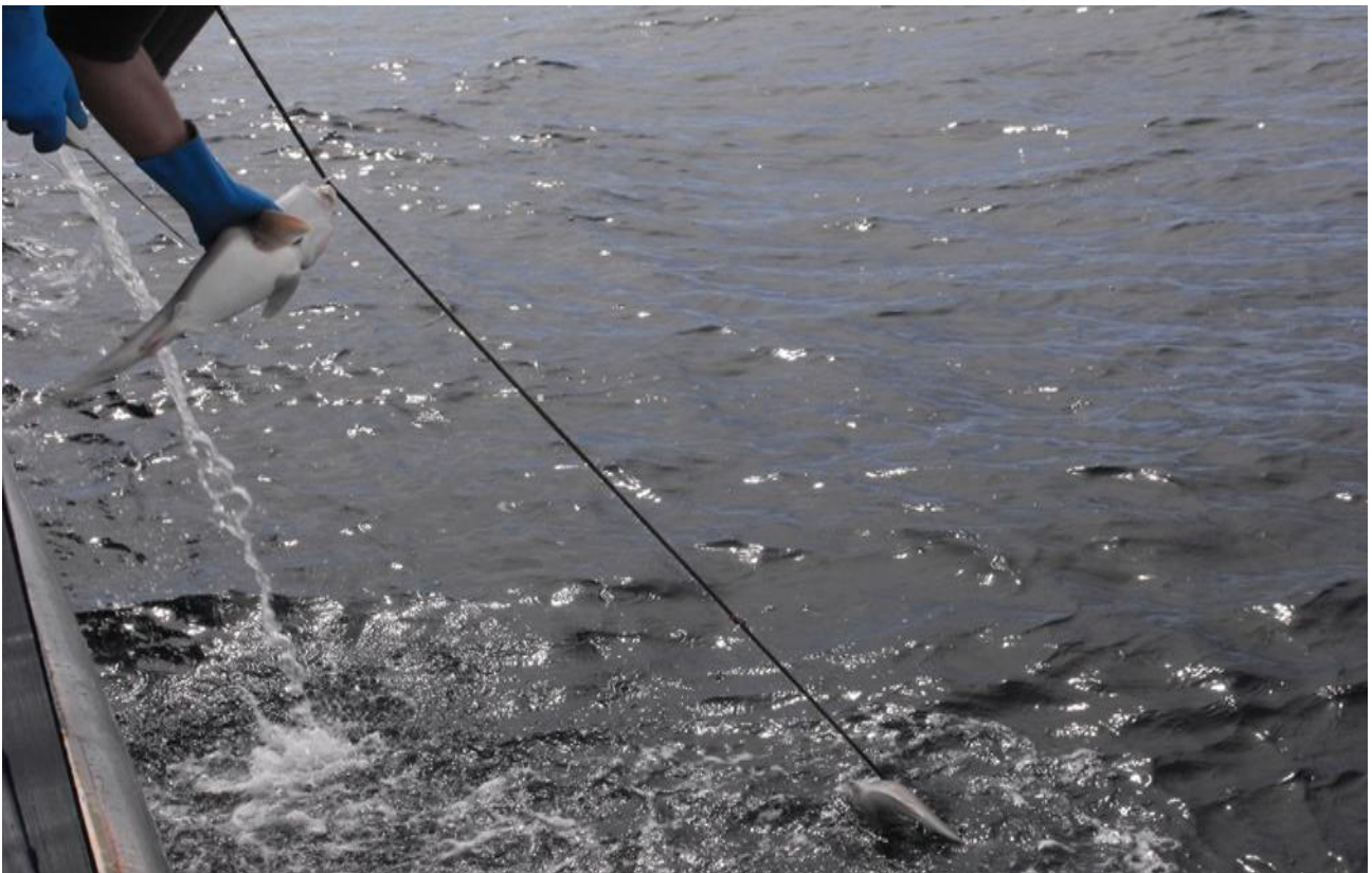
SESSF auto longline operation, correct removal of shark spp. before reaching auto de-hooker. Integrated Scientific Monitoring Program (ISMP), AFMA.

Where bycatch is not discarded immediately due to operational reasons, this is not to be considered mistreatment.