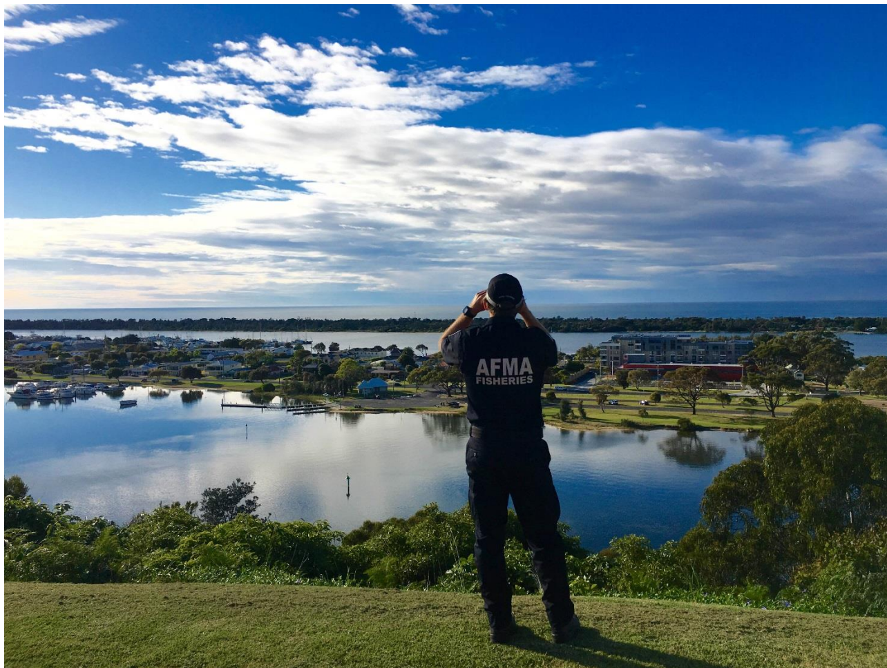
AFMA Compliance Officer, Lakes Entrance.

The maximum fine payable for a domestic fishing offence is $42,500 and or imprisonment of two years (as per the Crimes Act 1914 ).