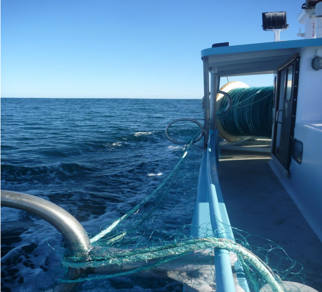
Gillnet vessel, looking forward. Integrated Scientific Monitoring Program (ISMP), AFMA.

Bycatch species should not be allowed to enter the drum and remain entangled within the fishing gear. Crew should consider wearing Personal Protective Equipment (PPE) to reduce the risk of injury. All reasonable steps must be taken to untangle bycatch and return it to its natural environment immediately.