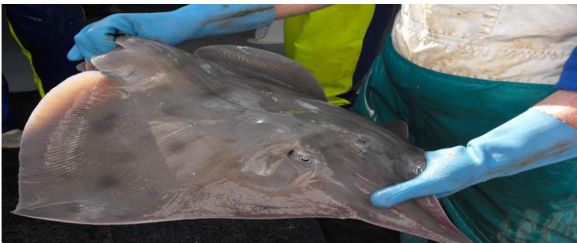
Correct handling, Skate species. Integrated Scientific Monitoring Program (ISMP), AFMA.