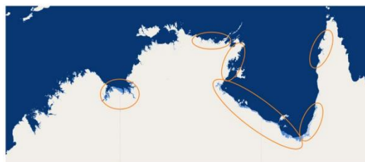
Predicted future sea level rise in Northern Australia through to 2030-2040.

The Torres Strait region is currently experiencing sea level increases at a rate of between 6-8mm per year. Models of sea level rise across Northern Australia predict as much as 20cm of further increase through 2030-2040.