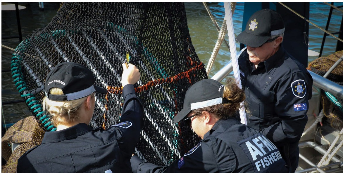
AFMA fisheries officers inspecting turtle excluder devices on Northern Prawn Fishery Trawlers

'Effectively deter illegal fishing in Commonwealth fisheries and the Australian Fishing Zone'