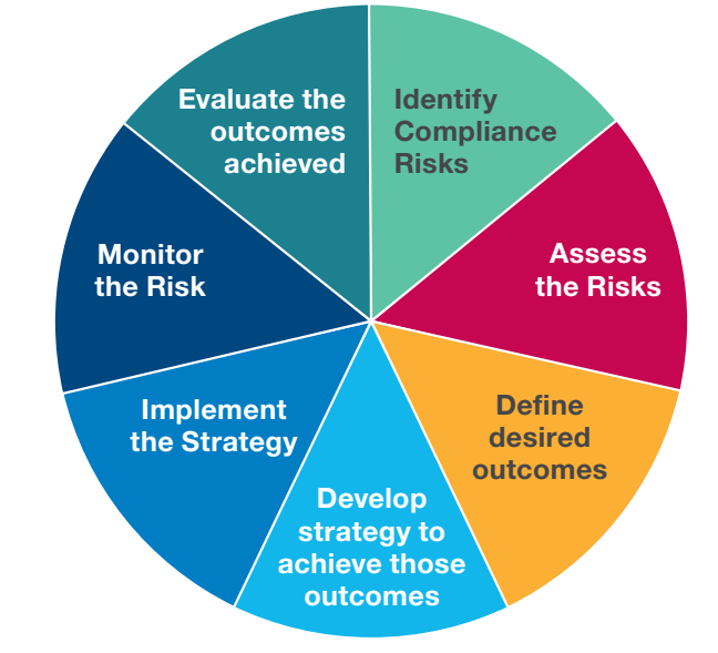
FIGURE 2: Compliance Risk Cycle