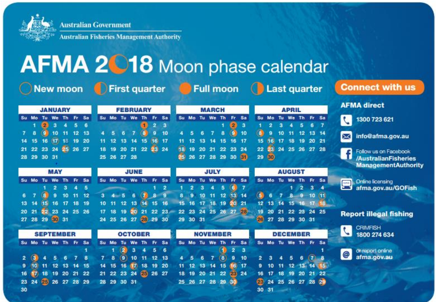
Figure 3: AFMA 2018 Moon phase calendar