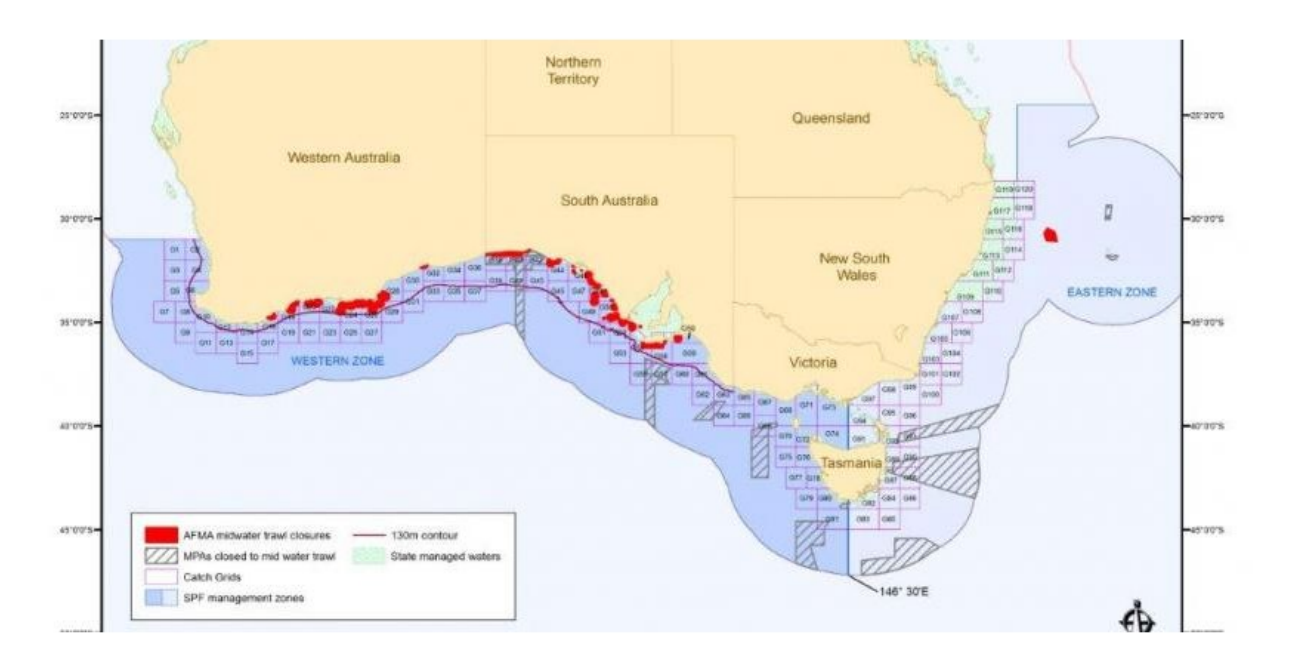
Figure 1. Area closures for mid-water trawl fishing methods in the Small Pelagic Fishery.

SPF operations are also required to adhere to spatial closures implemented under the South-East Commonwealth Marine Reserve Network.