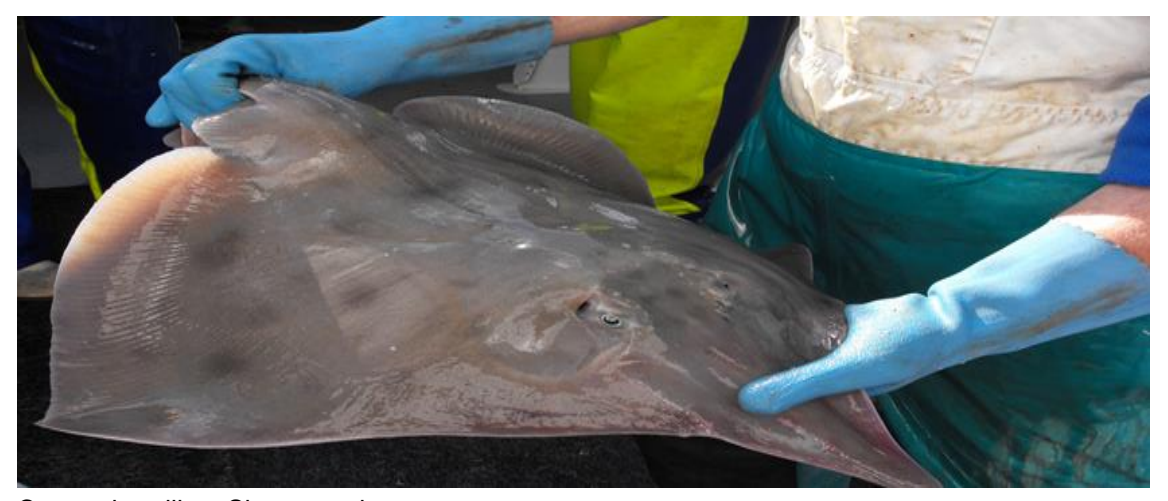
Correct handling, Skate species. Integrated Scientific Monitoring Program (ISMP), AFMA.