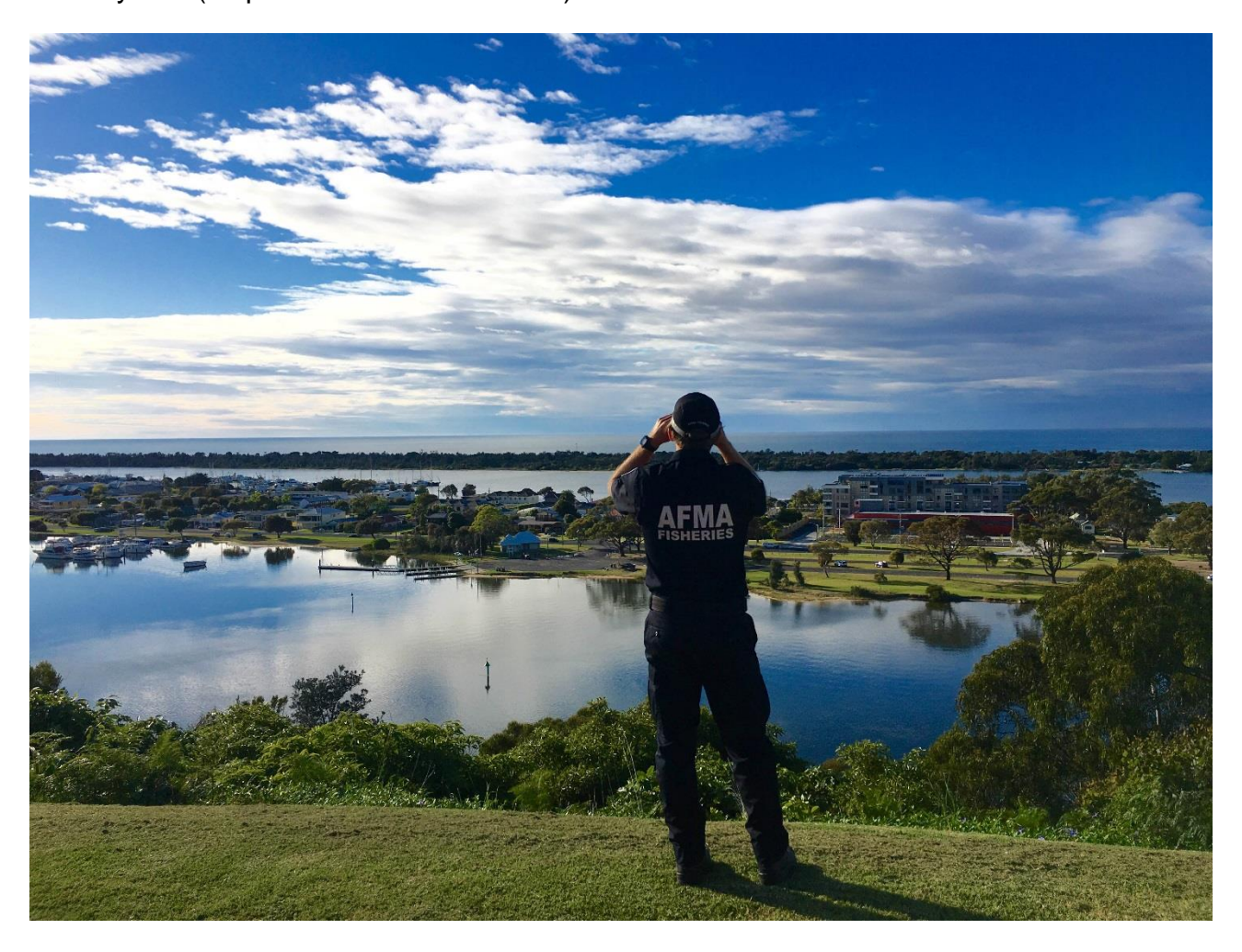
AFMA Compliance Officer, Lakes Entrance.

The maximum fine payable for a domestic fishing offence is $42,500 and or imprisonment of two years (as per the Crimes Act 1914 ).