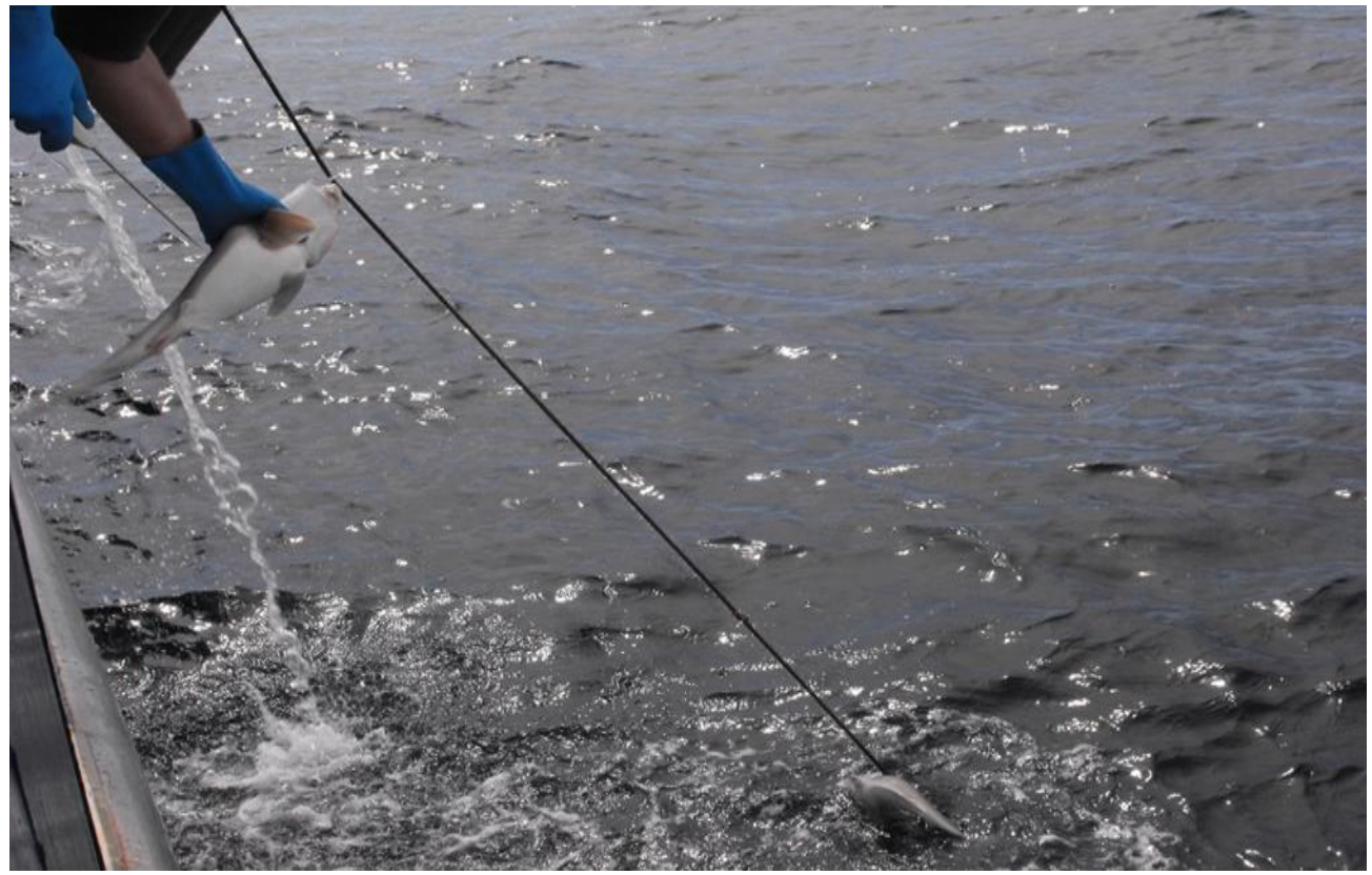
SESSF auto longline operation, correct removal of shark spp. before reaching auto de-hooker. Integrated Scientific Monitoring Program (ISMP), AFMA.

Where bycatch is not discarded immediately due to operational reasons, this is not to be considered mistreatment.