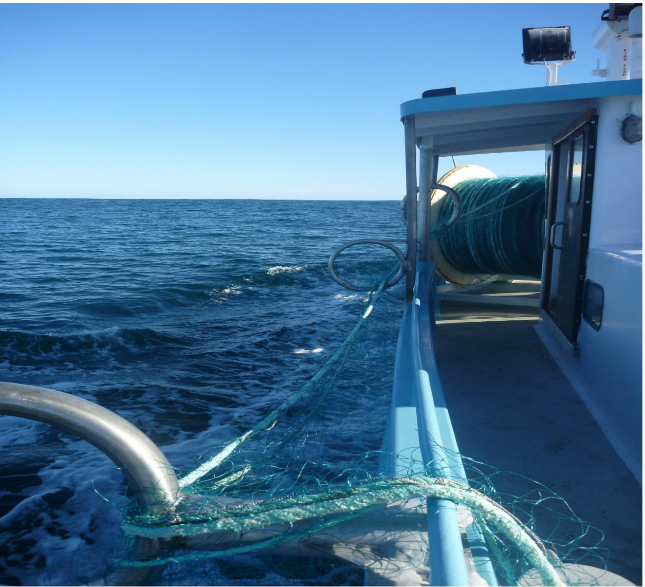
Gillnet vessel, looking forward.

Bycatch species should not be allowed to enter the drum and remain entangled within the fishing gear. Crew should consider wearing Personal Protective Equipment (PPE) to reduce the risk of injury. All reasonable steps must be taken to untangle bycatch and return it to its natural environment immediately.