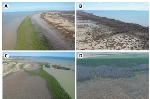
Photographs of Mangrove dieback in four example locations across southern Gulf of Carpentaria from Northern Territory to Queensland in 2016.

Mangrove ecosystems are critical nurseries for banana prawn species and habitats for estuarine and coastal fish species. Mangroves in the Gulf of Carpentaria are extending inland, which may be in response of rapidly rising sea levels. Projected long-term sea-level increase presents a risk of dieback events and may leave mangroves more vulnerable to intensifying El Nino seasons. El Nino conditions feature high temperatures, low precipitation and drop in sea levels, which can cause mangrove dieback from moisture stress.